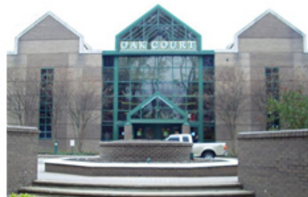
LOCATION - OAK COURT MALL

*Three large eagles will encircle the monument, symbolic of freedom and protection, yet understating one of their teammates (fourth corner) is missing.