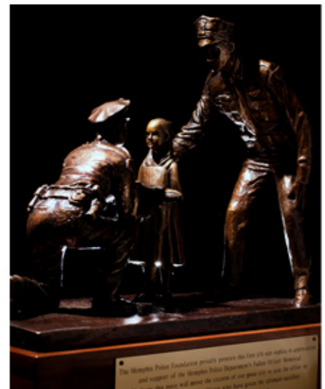
1/6 SIZED BRONZE MOCK-UP